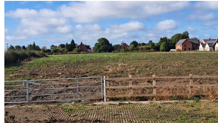
View taken from Pump Station, looking west from Rothersthorpe Road