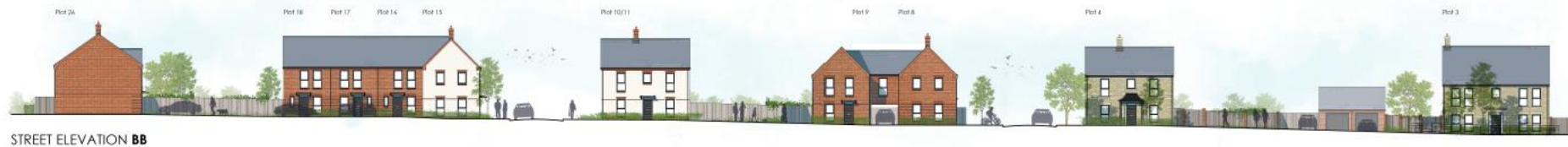
STREET ELEVATION BB

(Above timeline is subject to planning and s106 resolution)