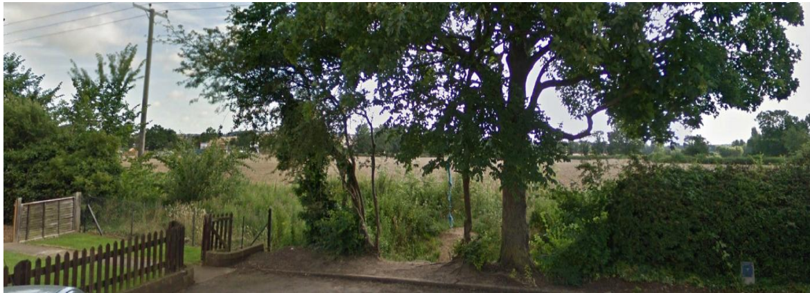
View taken from the end of Miller's Close looking across to the south western corner of the site.